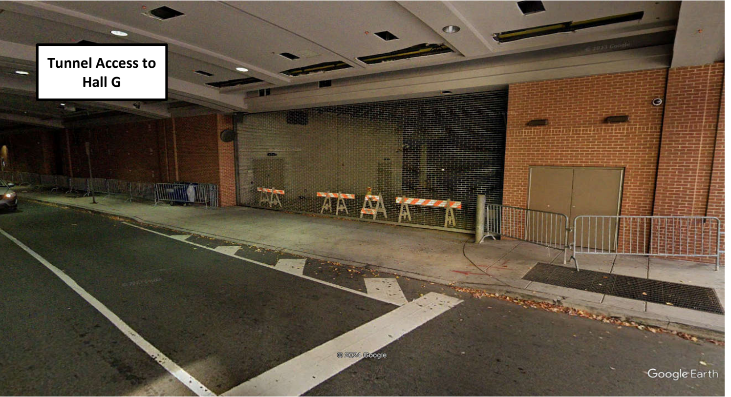
Tunnel Access to Hall G